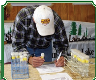
Recording water samples (M Lysne)