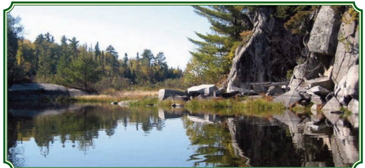
Goose Island, Rainy Lake (P Callaghan) ↑ ↓ Islands on Rainy Lake (M Lysne)