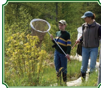
Dragonfly hunting in the bog ↑ Constructing loon nesting platforms ↓

One of the major goals of the 2004 Ontario Trillium Foundation grant was achieved with the opening of the Cranberry Peatlands Interpretive Trail. This trail gives the public a chance to walk safely into a bog and understand and appreciate the value of wetlands.