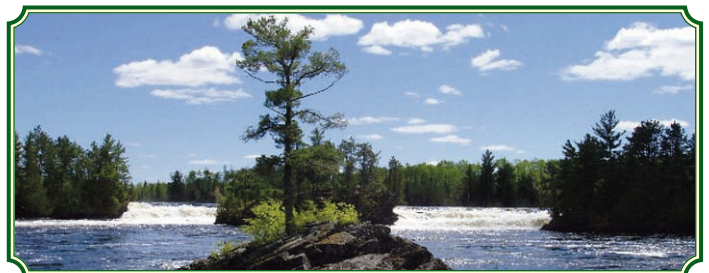
High Falls on the Namakan River