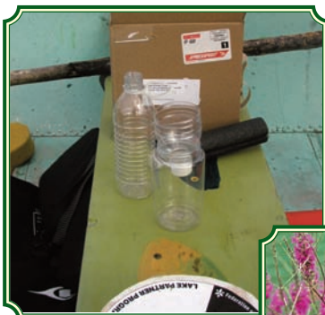
Basic water sampling tools ↑ Purple loosestrife (JD Byrd) →

Rainy Lake Conservancy newsletters, Spring and Fall 2005