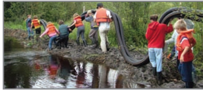
Hauling beaver baffler drain pipe

Early in the development of the Cranberry Peatlands Interpretive Trail, it became apparent that beaver dams were causing the water levels to rise in the bog, often making the trail and boardwalk too wet to use.