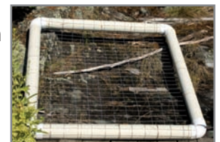
A completed loon nesting platform