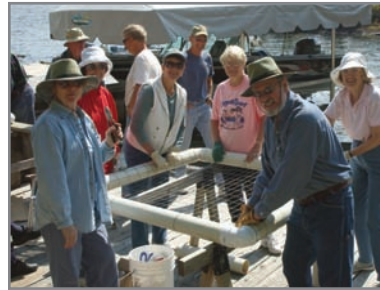
Assembling loon nesting platforms

This past summer's nature outing was an endeavor to add nesting sites that would not be destroyed by fluctuating water levels. On August 30th, the docks at Red Pine Island were abuzz with activity as participants sawed, glued, fitted pipe together and assembled loon-nesting platforms.