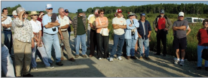
Grand opening ceremony is enjoyed by members of RRVFN, RLC, NCC, donors and guests

One of the major goals of RLC's $48,900 Ontario Trillium Foundation grant was achieved with the opening of the Rainy River Valley Field Naturalists' Cranberry Peatlands Interpretive Trail in July 2006.