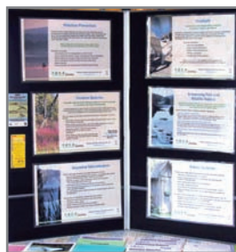
Docktalk display P.Larsen