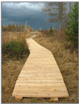
Bog's new boardwalk by Ilka Milne

Ilka Milne has informed us that the maps, including identified target species, will be presented to area partners for use in the development of the NWO conservation plan. The bog's interpretive trail got a new section of boardwalk with another 150 feet planned for construction this spring. Beaver bafflers are being installed in an attempt to lower the water level to prevent flooding of the boardwalk. Look for more information on beaver bafflers in our fall newsletter.