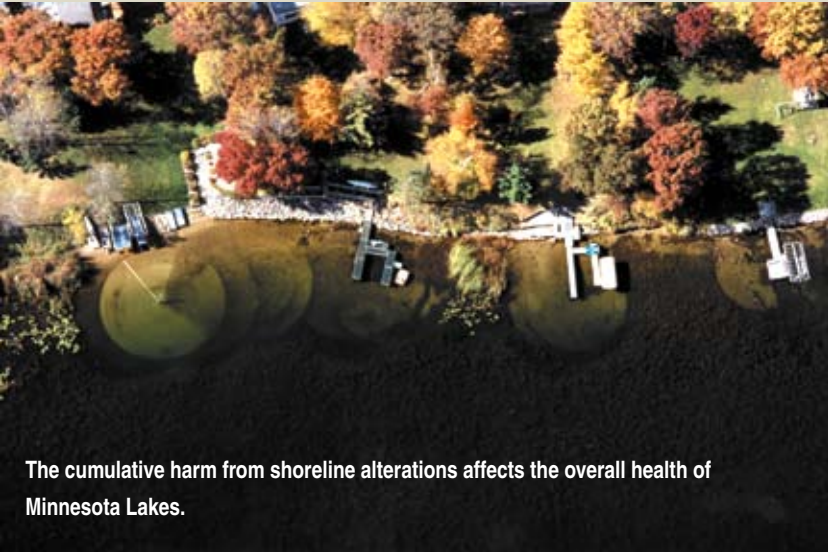
The cumulative harm from shoreline alterations affects the overall health of Minnesota Lakes.

It's like walking in a garden. If a neighbor kid came through once, that would be no big deal. But if the whole neighborhood came through, your garden would be trampled.