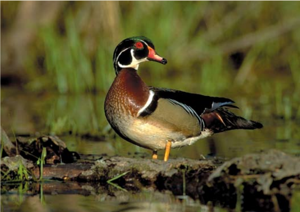
Healthy wetlands attract nesting and migrating waterfowl.